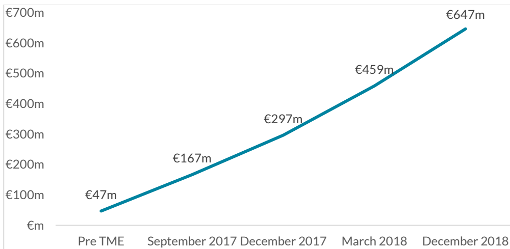
Chart 2: Value of Redress and Compensation Payments

Breaking this down further, 97 per cent of affected customer accounts already identified and verified have now received offers of redress and compensation. Approximately 1,900 accounts (verified and unverified) remain to be paid which we expect lenders to have substantially completed in Q1 2019.